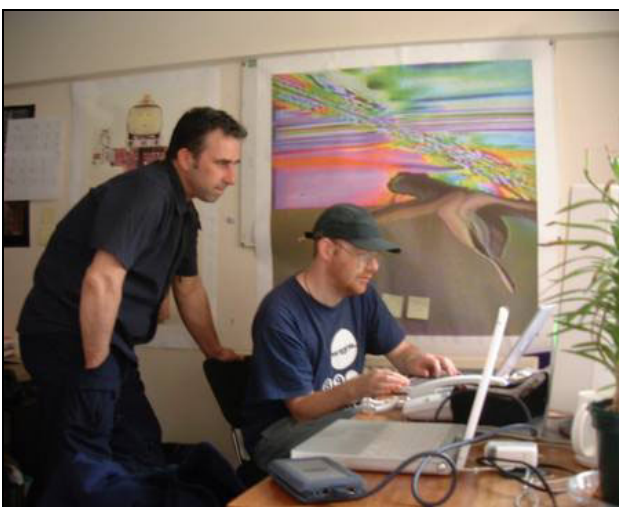
Figure 1. Technologist (right) constructing and participating in the artist's (left) creative environment.